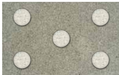
TRADITIONAL MUJACKING Holes are larger and require more to be installed.

Commercial & Industrial applications: Roadways, Undersealing, Warehouse floors, Airport Runways, and Bridge approaches.