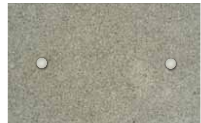
POLYURETHANE LEVELING Smaller and fewer holes required.