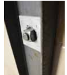
OR C-CHANNEL FOR CONCRETE BLOCK FOUNDATIONS

All components are hot-dip galvanized to increase product life in aggressive soils.